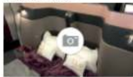
Gallery: Qatar unveils QSuite at Paris Air Show

Thales, DSN, ENAV and Leonardo have strengthened their cooperation for Coflight, new generation flight data processing system designed for the Single European Sky by launching a long-term maintenance contract.